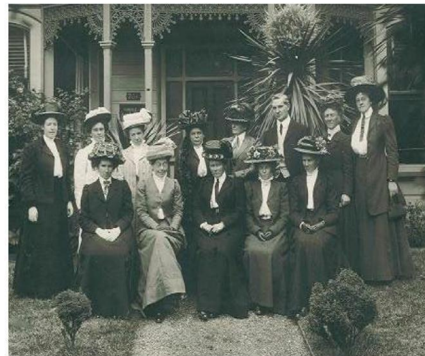
The first meeting of the New Zealand Trained Nurses Association in 1909

NZNO is a complex organisation but the relationship and interconnectedness of all components of the organisation is critical to achieving our goals and realising our vision — that all NZNO members are freed to care and proud to nurse.